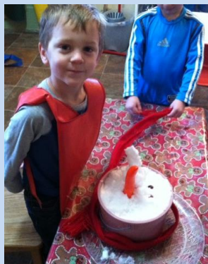
Gingerbread Houses and Snowmen