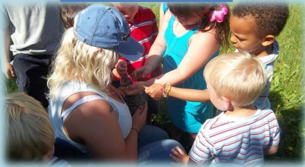
Our baby chicks and ducklings have GROWN