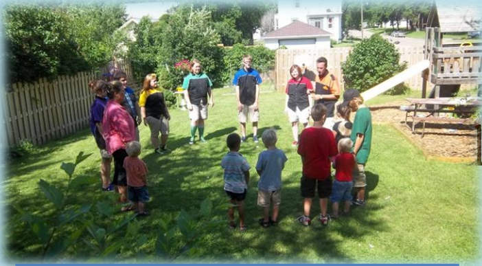
Story book land performers come to our school