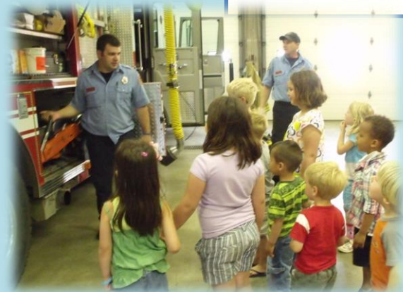
The trip to the fire station