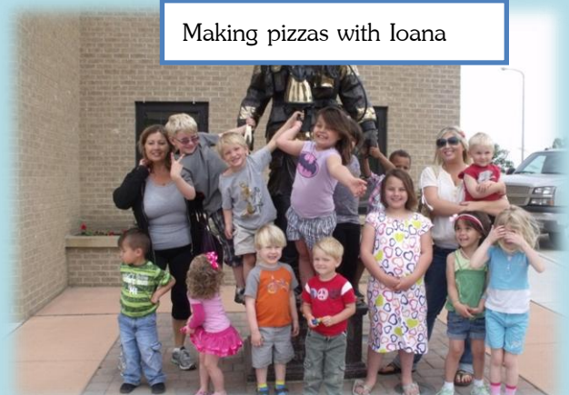
Trip to the downtown fire station