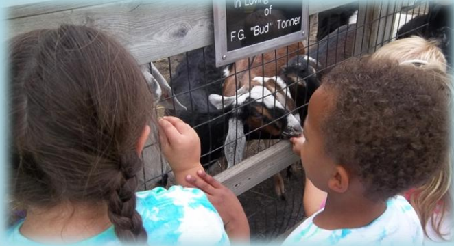
Petting zoo at Wylie