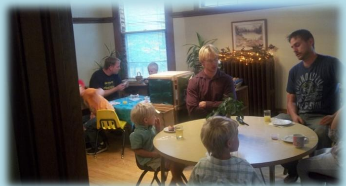
Father's Day breakfast